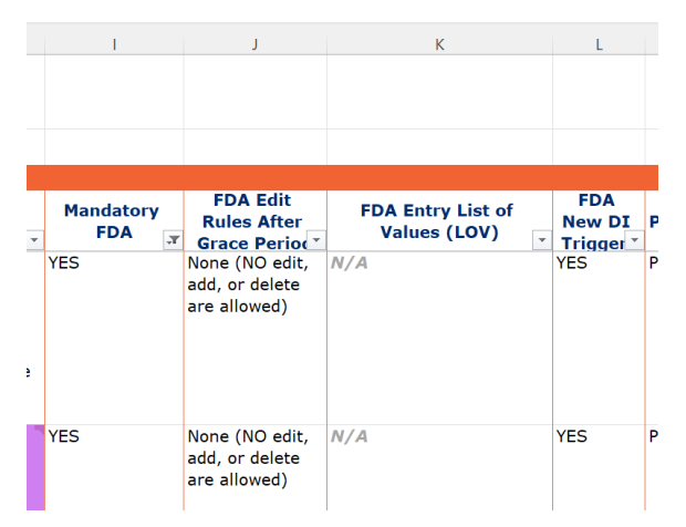
Figure 5.1 FDA attributes selection

Notice that some attributes cannot be changed after the Grace period (column J 'FDA Edit Rules After Grace Period'). In the test environment the Grace period is 1 day. In the Live environment it is 30 days. Also watch carefully which values are permitted by the FDA (column K 'FDA Entry List of Values (LOV)').